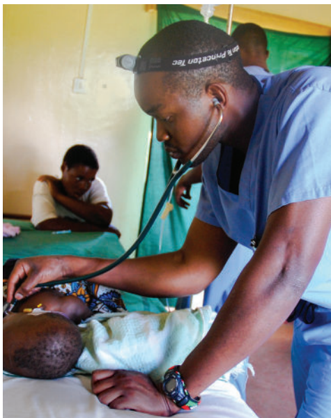
Below: A health care provider treats an infant at the Lwala Community Hospital, which was expanded through a 2009 commitment made by Lwala Community Alliance and partnered on by SFF—“Safe Motherhood in Lwala, Kenya.”