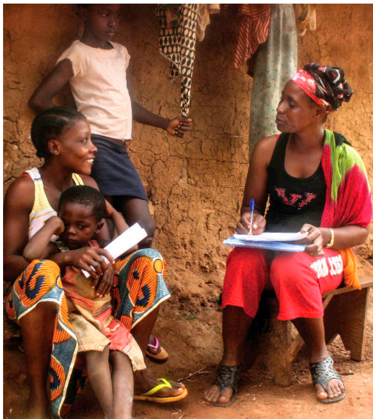
Below right: Burundian producers work to develop a radio soap opera that will spread critical messages on reproductive, maternal, and child health in Burundi, part of a 2013 commitment by Segal Family Foundation—“Radio Soap Opera for Improving Health Outcomes in Burundi.”