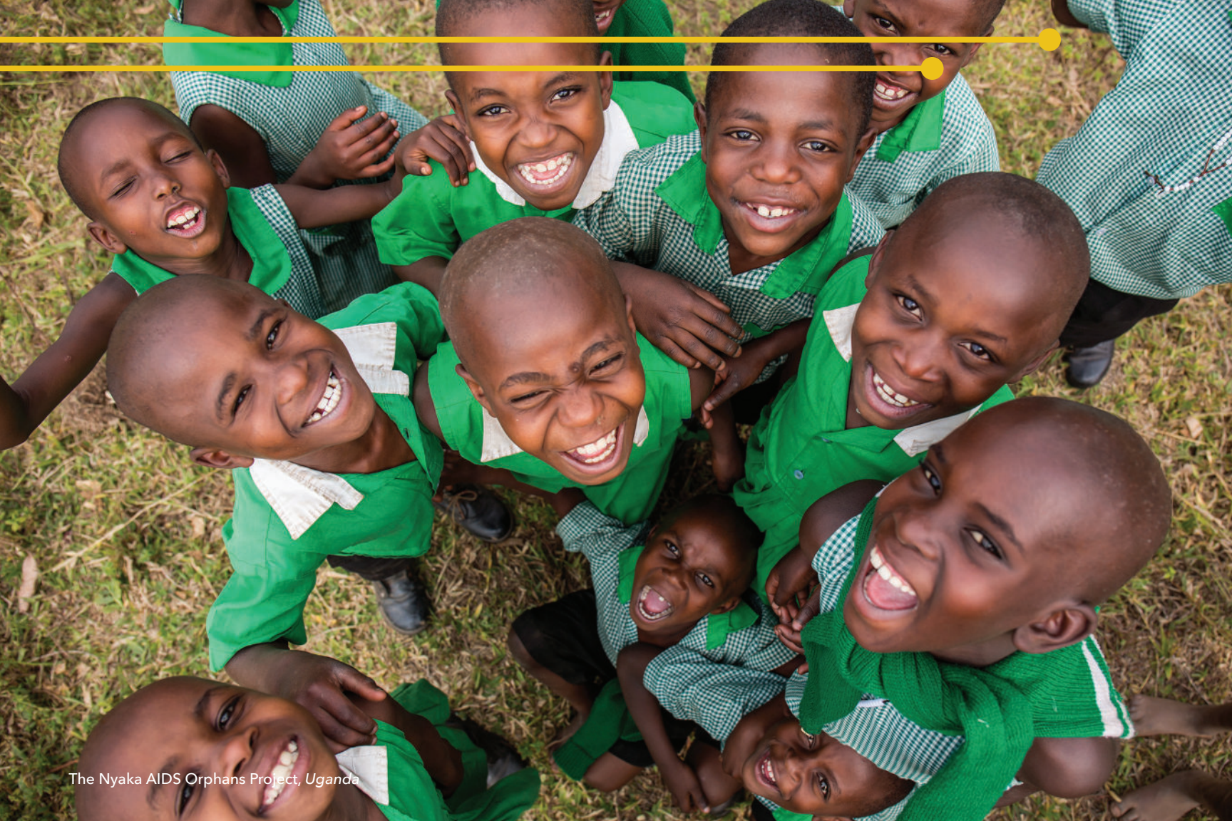
The Nyaka AIDS Orphans Project, Uganda